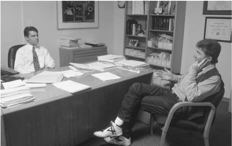
This man is dressed much too informally to make an effective impression on the interviewer.