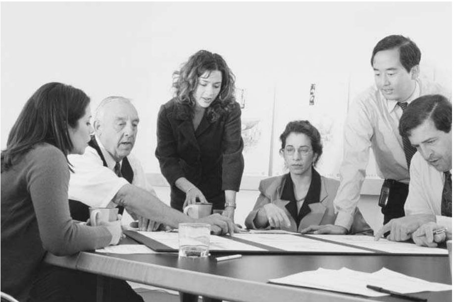
An effective meeting combines all types of communication skills.

50 percent of the productivity of the billions of meeting hours is wasted.” Why? Poor meeting preparation, they explain, and lack of training on how to conduct meetings effectively are the culprits. As a result, employees tend to tune out and fail to participate. A well-run meeting combines the writing, speaking, and listening skills that we’ve been discussing in this book. Whether you’re leading a meeting or are just a participating in one, you need to communicate clearly.