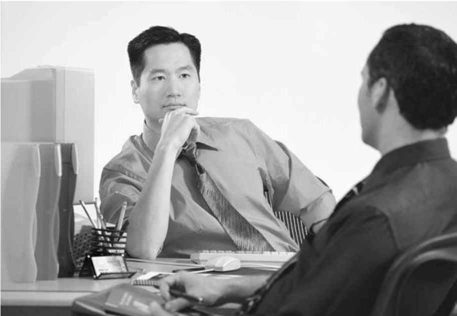
Being a good listener will expose you to new ideas and viewpoints—and help you do your job better.

To stay focused during a long presentation, it also helps to take notes. You don't have to worry about all the details; just listen for the main ideas and write them down. This will help you to concentrate and avoid becoming distracted. Some presentations are followed by question-and-answer sessions. It's often a good idea to formulate questions while you